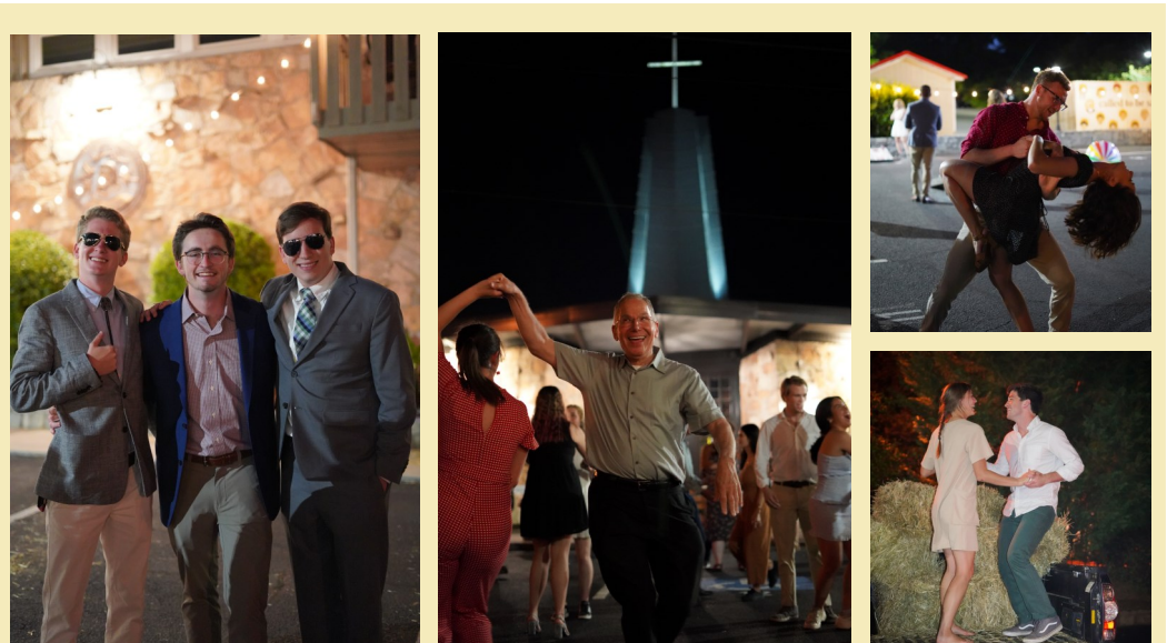
Photos from our Student's Semi-Formal on May 1