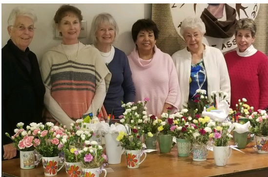
Homebound Basket Ministry