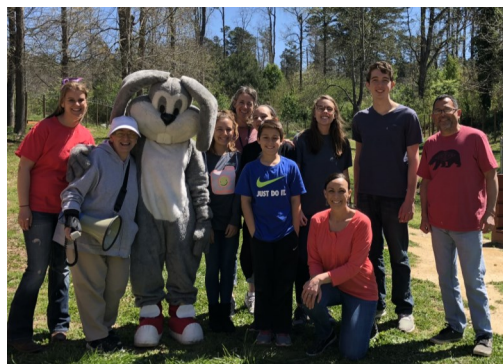
Easter Egg Hunt for Oasis Catolico